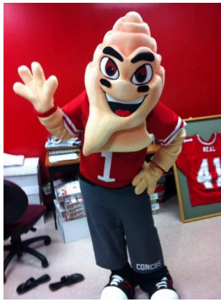
Conchy Conch – Mascot